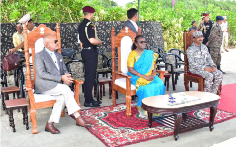
Hon'ble President, Smt. Droupadi Murmu interacting with Soldiers of TOB, unit 154 Infantry Battalion (TA) BIHAR & Tri-Service troops at Indira Point