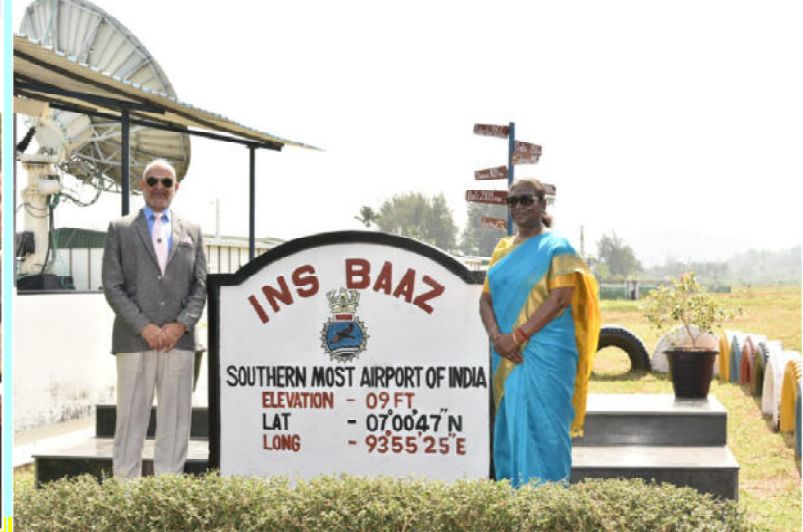
Hon'ble President, Smt. Droupadi Murmu at INS BAAZ, Southernmost Airport of India, Campbell Bay