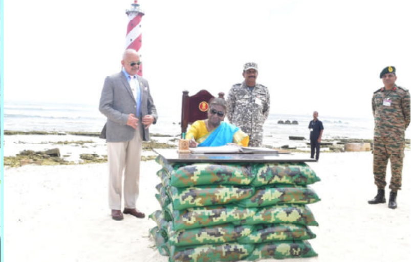
Hon'ble President, Smt. Droupadi Murmu penning her experience in the Visitor's Book at Southernmost tip of India, Indira Point