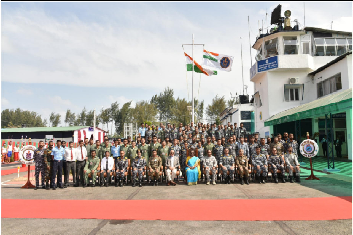
Hon'ble President, Smt. Droupadi Murmu with troops at INS BAAZ