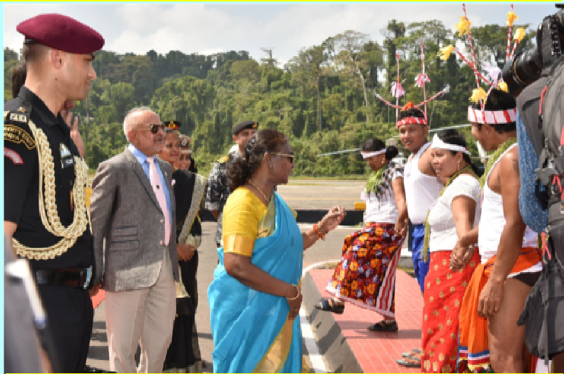
Hon'ble President, Smt. Droupadi Murmu interacting with members of local tribal communities at Campbell Bay

During the visit to Campbell Bay, Hon'ble President witnessed the dance presented by tribal people, showcasing a glimpse of the tribal culture of Great Nicobar Island. The Hon'ble President appreciated the tribal dance presented by the tribal group. The Hon'ble President also interacted with the Chairman and Captains of Tribal Community. She also visited the stall put up by the Tribal Self Help Group (SHG) members, showcasing the tribal handicraft items and also interacted with them. The SHG members welcomed the Hon'ble President by presenting a replica of Nicobari Hut as a souvenir.