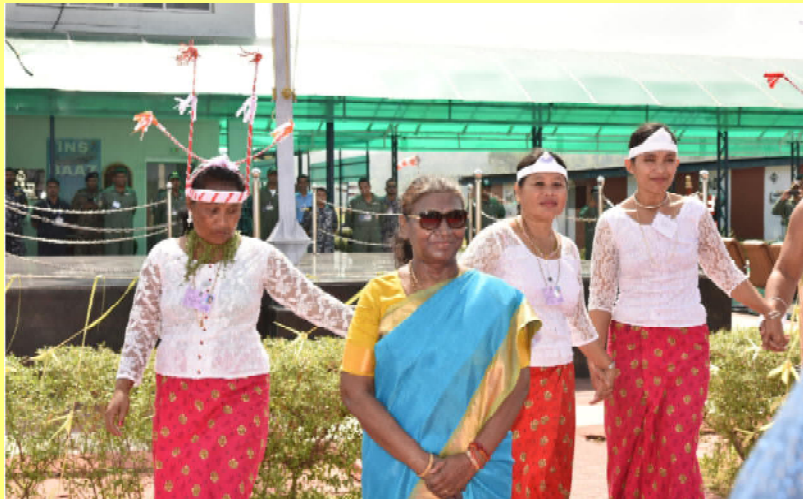
Hon'ble President, Smt. Droupadi Murmu with members of local tribal communities at Campbell Bay