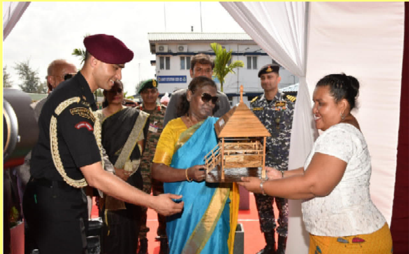
Hon'ble President, Smt. Droupadi Murmu being presented a replica of Nicobar Hut as a souvenir by SHG members at Campbell Bay