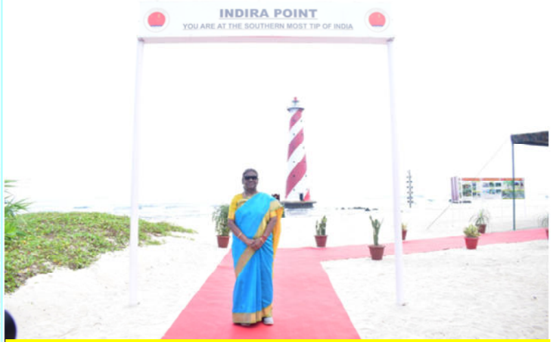
Hon'ble President, Smt. Droupadi Murmu at Southernmost tip of India, Indira Point