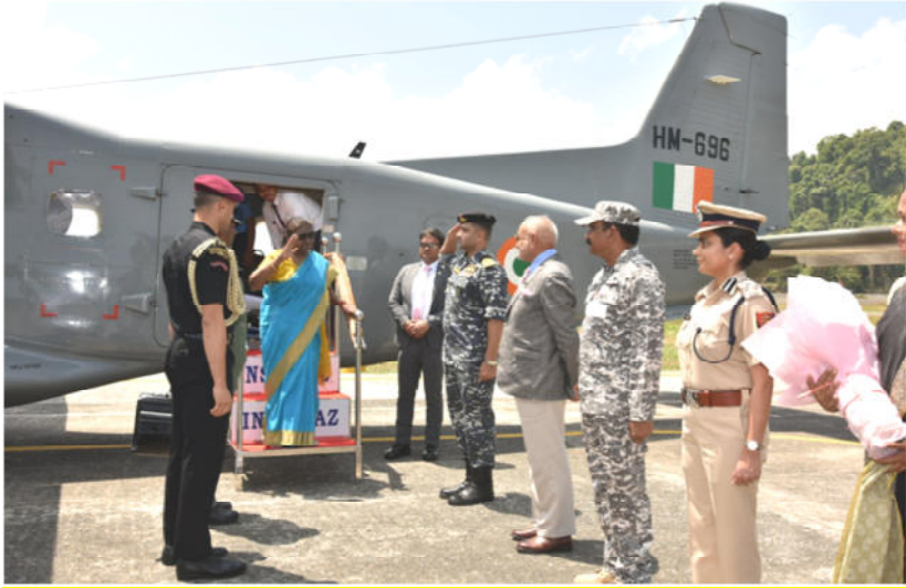
Hon'ble President, Smt. Droupadi Murmu being accorded a warm welcome on her arrival at Campbell Bay