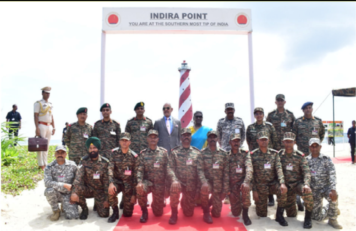
Hon'ble President, Smt. Droupadi Murmu with troops at Indira Point