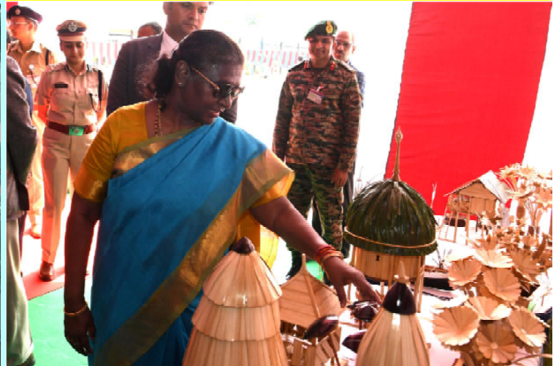
Hon'ble President, Smt. Droupadi Murmu visits stalls set up by local tribal communities at Campbell Bay

The visit also included halt at Car Nicobar Island, where the Hon'ble President was briefed on Great Nicobar Island, infrastructure projects and Andaman & Nicobar Command's (ANC) efforts to safeguard national interests. The visit highlighted the strategic importance of the region and ANC's vital role in safeguarding national interests.