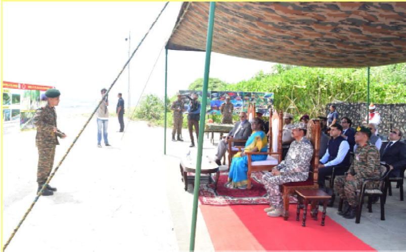
Hon'ble President, Smt. Droupadi Murmu being briefed about TOB at Indira Point